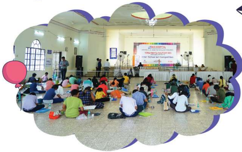
On the occasion of "World Mental Health day", an Inter-School Art competition was conducted in Salem, with approximately 200 students participated from various schools.