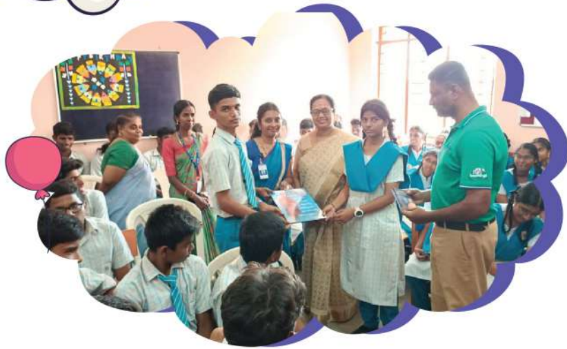
The session was conducted on the topic of "Coping with stress" for class XI and XII students at Equitas Gurukul Matric School in Salem.