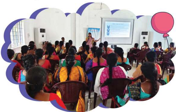
A session on the "Identification of mental health issues in children" was conducted for school teachers at Glazebrooke School in Salem.