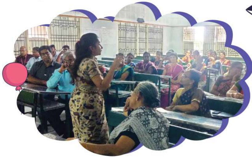
The session on the topic of "Identification of mental health issues in children" was conducted for school teachers at Jairam Higher Secondary school in Salem.