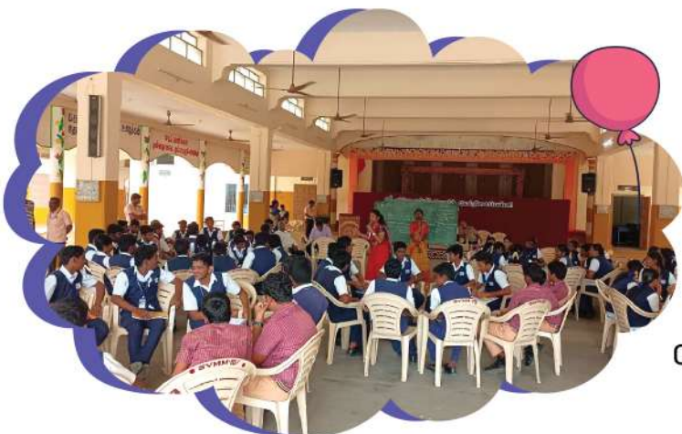
On "World Suicide Prevention day", Life Skills Training program was organized for class XII students at Shri Vidya Mandir school in Rasipuram. The topic discussed with the students was "How to cope with stress and saying no to Suicide".