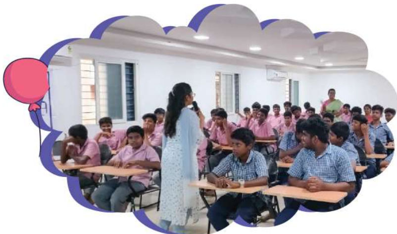
The session on the topic of "Coping with stress" was conducted for class IX to XII students at Paavadi Higher Secondary School in Salem.