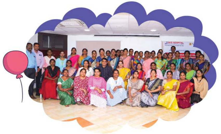
One day workshop for school teachers was organized on the topic of "Learning challenges among children- Remedial and teaching strategies" at SKS Hospital in Salem. Around 45 teachers from various schools in Salem attended the workshop.