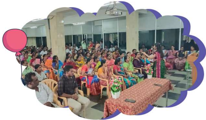
The interactive session was held for parents on the topic of "Parenting in Digital Era" at Gayathri Matric School in Salem.