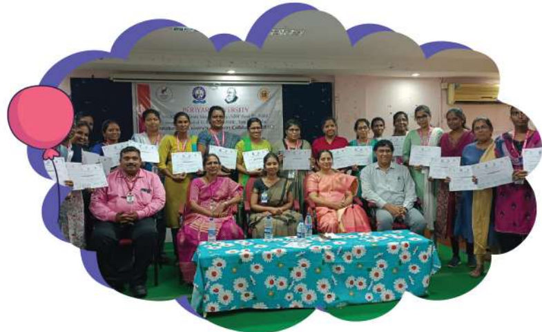
A keynote address focusing on "Learning challenges among children" was delivered during the Regional Conference held at Periyar University in Salem.