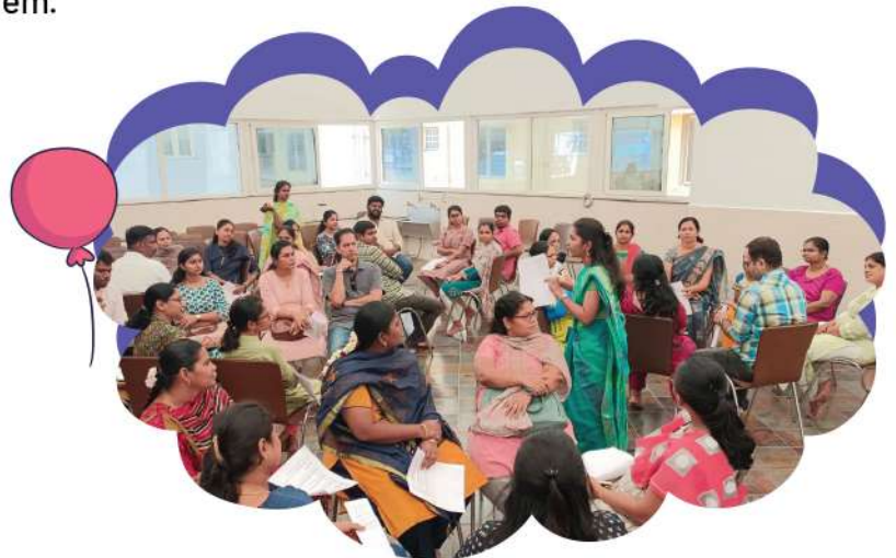
Our first parenting workshop was conducted at Vriksha Montessori International school in Salem. Positive parenting strategies were discussed.