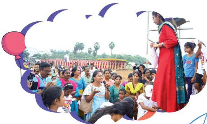
At the Kiddathon centre stage in Salem, an engaging and thought provoking "Parenting drama" was organized by our Child Psychiatry team.