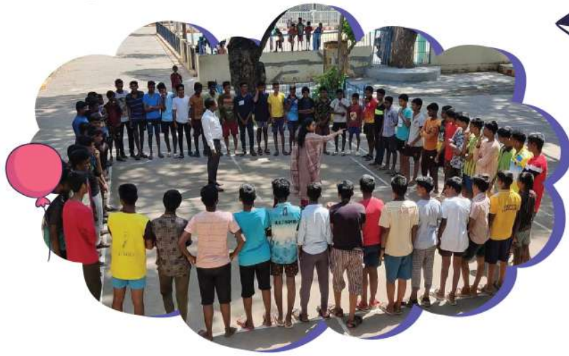
The session on the topic of "Coping with stress" was conducted for class IX to XII hostel boys at St. Paul's Higher Secondary School in Salem.